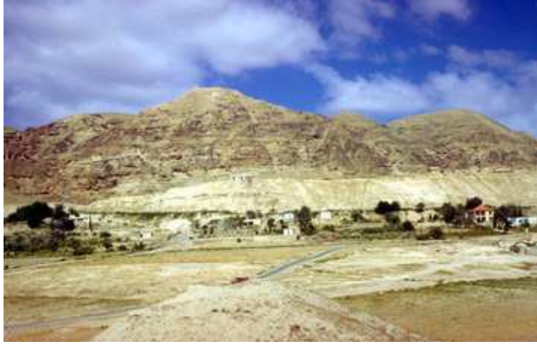
Mount of Temptation, Traditional site of the Temptation of Jesus

12 At once the Spirit sent him out into the desert, 13 and he was in the desert forty days, being tempted by Satan. He was with the wild animals, and angels attended him.